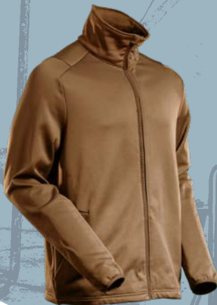
54 nut brown