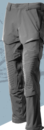
89 Stone grey