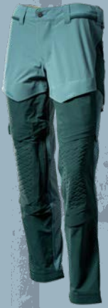
3534 Light forest green / forest green