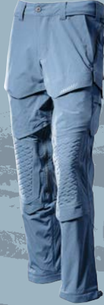
85 Stone blue