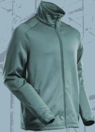
35 light forest green