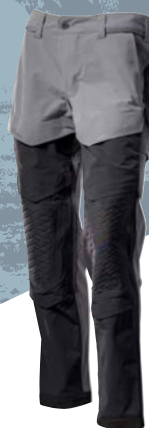
8909 Stone grey / black