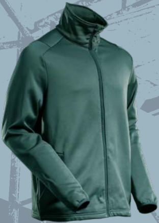
34 forest green