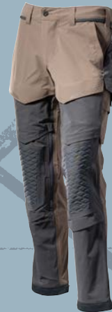
5689 Dark sand / stone grey