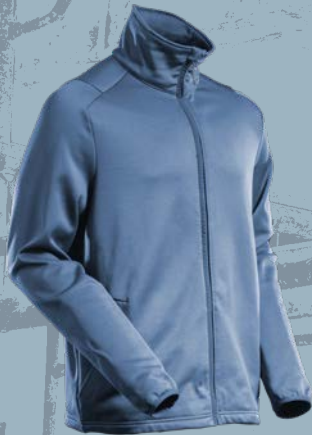
85 stone blue