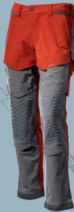
2489 Autumn red / stone grey