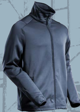
010 dark navy