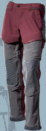
2289 Bordeaux / stone grey