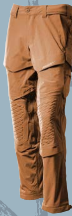
54 Nut brown