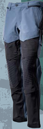
85010 stone blue / dark navy