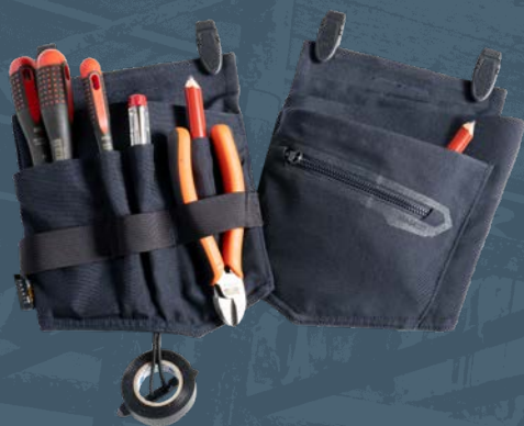
22550-012 Electrician holster pocket