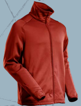
24 autumn red