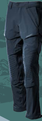
010 Dark navy