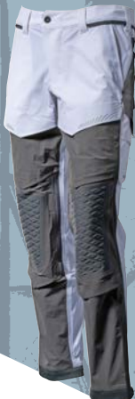
0689 White / stone grey