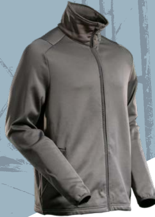
89 stone grey