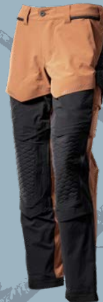
5409 Nut brown / black