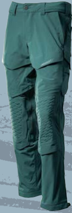
34 Forest green